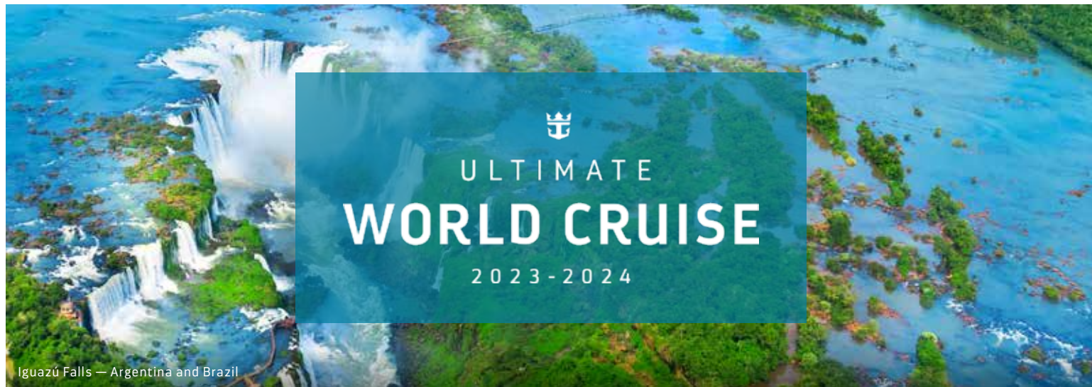
Iguazú Falls — Argentina and Brazil