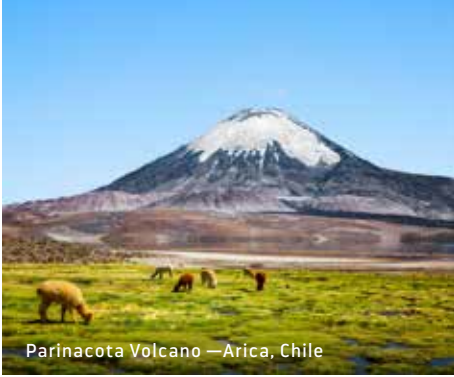
Paríacota Volcano — Arica, Chile