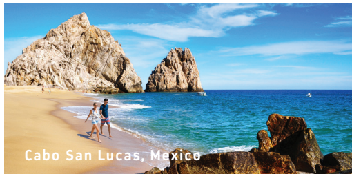
Cabo San Lucas, Mexico