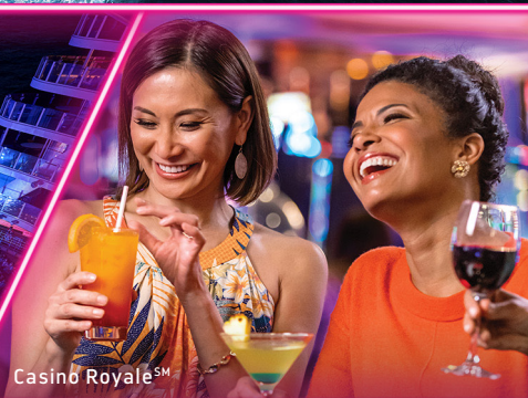
Casino Royale SM