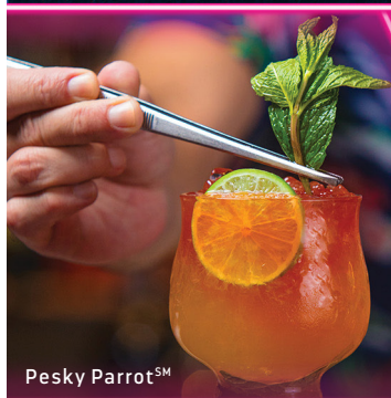
Pesky Parrot SM