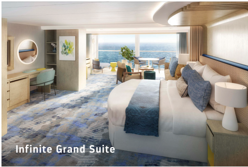
Infinite Grand Suite