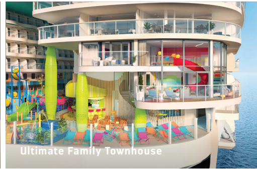
Ultimate Family Townhouse