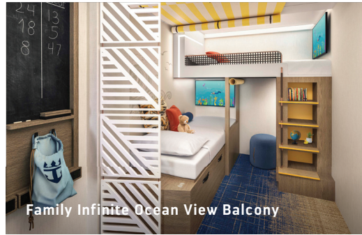
Family Infinite Ocean View Balcony