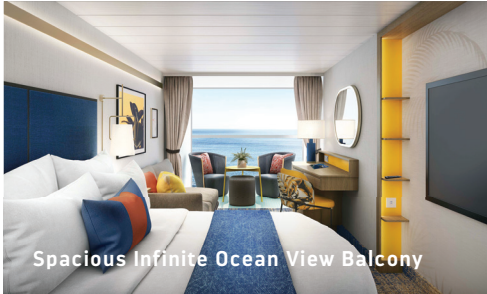
Spacious Infinite Ocean View Balcony

There's no shortage of spectacular ocean views right from your room. In Spacious Infinite Balcony rooms, the expanded living area becomes an oceanfront balcony at the push of a button. Floor-to-ceiling windows in Panoramic Ocean View rooms deliver dazzling sights from the revolutionary AquaDome SM . Or upgrade to the suite life. Panoramic Suites deliver a front row seat to scenery scoping. And the view doesn't get any better than from Sunset Corner Suites, with wrap-around balconies and endless blue in all directions.