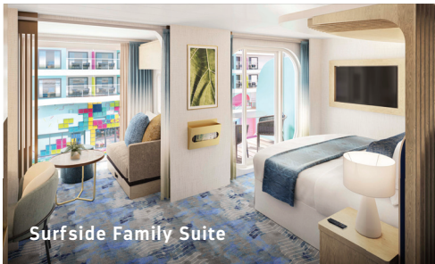
Surfside Family Suite

Innovative Spacious Infinite Balcony rooms put extra room — or a fresh breeze — right at your fingertips with a convertible balcony on-demand. Choose your view and overlook endless blue ocean or the tranquil Central Park ® . Even bigger Family Infinite Ocean View Balcony rooms are a kid's dream, where a separate hideaway bunk room gives them their own beds, TVs, and space to chill.