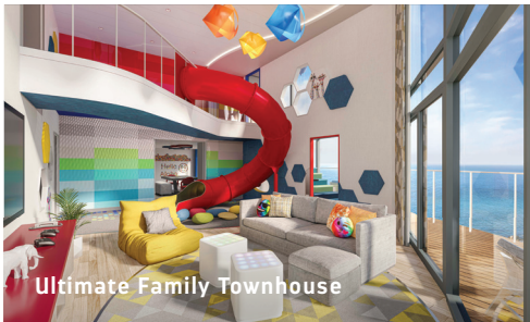
Ultimate Family Townhouse

Finding your crew's just-right space is easy, with rooms specially designed for families. Family Infinite Ocean View Balconies offer separate hideaway bunk room to give kids their own beds, TVs, and space to chill. And Surfside Family Suites are smartly designed to dial up the convenience for everyone — with a spacious split bathroom plus a cozy room for the little ones.