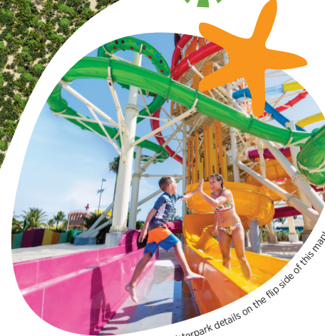
More Thrill Waterpark details on the flip side of this map!