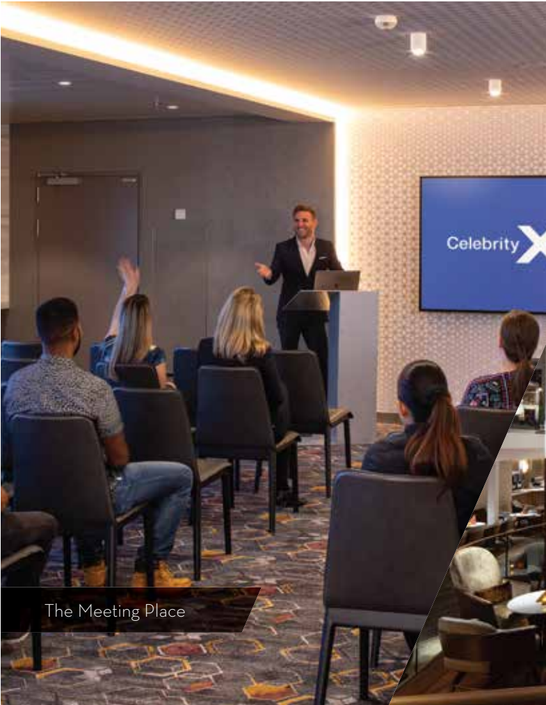
The Meeting Place