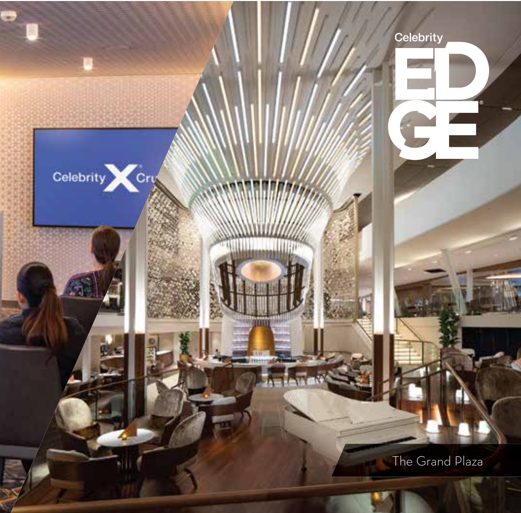
The Grand Plaza