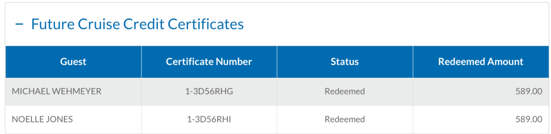
All names and details are fictitious and used for illustration only.

The full value that was redeemed for each certificate is shown in Espresso on the Reservation Summary page in a section labeled Future Cruise Credit Certificates. For this reservation, a total of $1178.00.