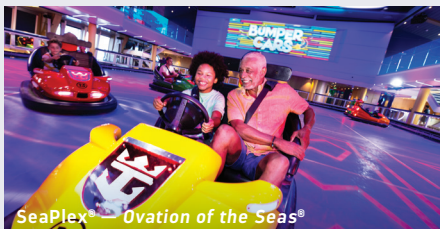
SeaPlex® — Ovation of the Seas®

Consider your bucket list for The Last Frontier conquered. Discovering a bounty of wildlife in the Alaska's capital city, Juneau? Check. Traveling back in time to the era of The Gold Rush in Skagway? Done. From savoring fresh-caught local salmon in Ketchikan to kayaking with sea otters in Sitka. Or setting your eyes on the largest tidewater glacier in North America, Hubbard Glacier. Nothing is more gratifying than crossing all these once-in-a-lifetime experiences off your list on one unforgettable journey.