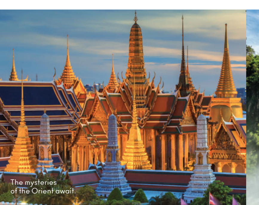
The mysteries of the Orient await.

Sailing October to March FEATURED HOLIDAY SAILING 12-Night New Zealand Cruise Celebrity Solstice® Departs: Sydney | December 23, 2019