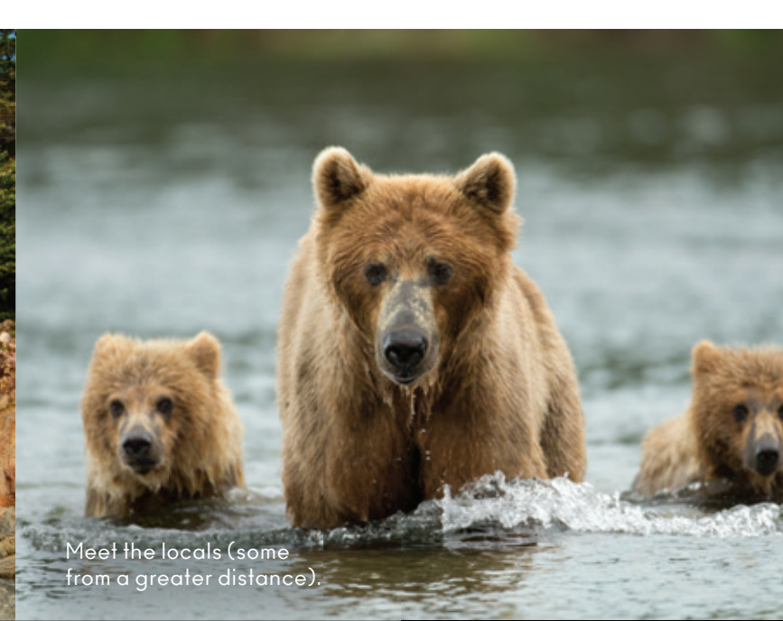
Meet the locals (some from a greater distance).

Our newly revolutionized Celebrity Summit will take your getaway to a luxurious new level.