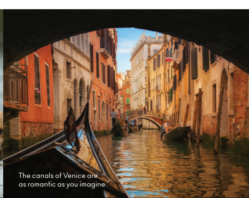
The canals of Venice are as romantic as you imagine.

Sailing May to September FEATURED SAILING 7-Night Alaska Hubbard Glacier Cruise Celebrity Eclipse® Departs: Vancouver | May 31, 2020