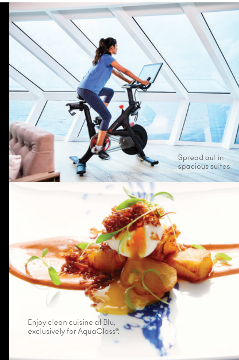
Spread out in spacious suites.