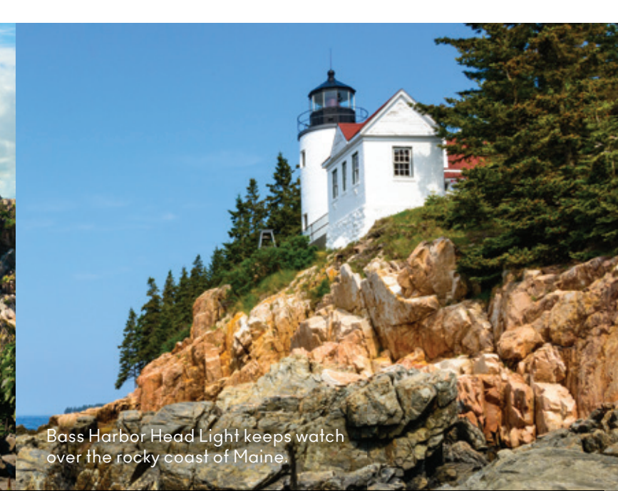
Bass Harbor Head Light keeps watch over the rocky coast of Maine.

Sailing all year long FEATURED SAILING 7-Night Western Caribbean Cruise Celebrity Edge® Departs: Fort Lauderdale | December 8, 2019