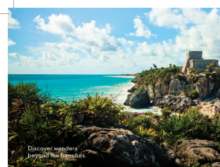
Discover wonders beyond the beaches.