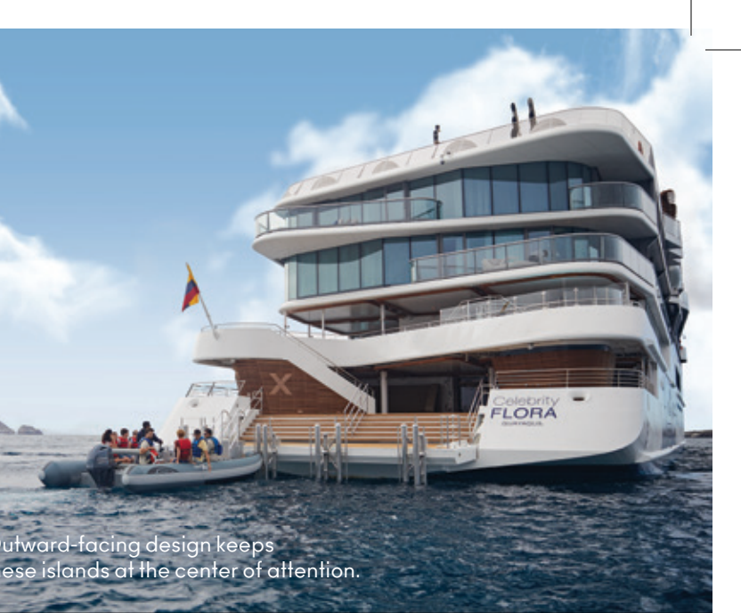
Outward-facing design keeps these islands at the center of attention.

Sailing November to March FEATURED HOLIDAY SAILING 15-Night Argentina & Chile Cruise Celebrity Eclipse® Departs: Buenos Aires | December 21, 2019